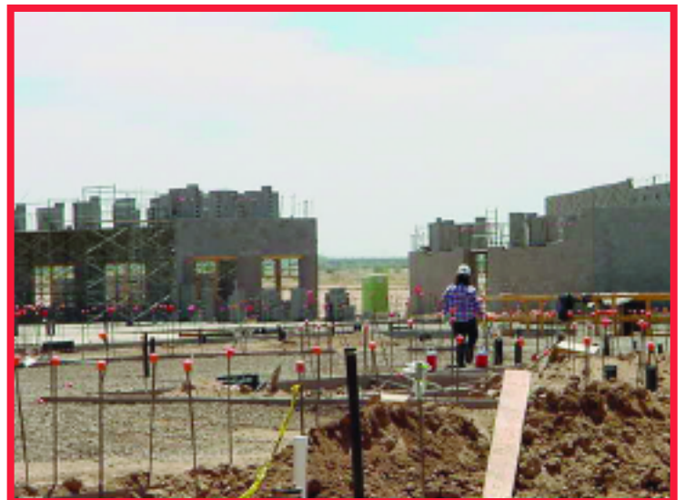
GRIC Governance Center