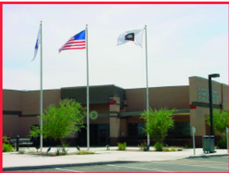
Juvenile Detention and Rehabilitation Center