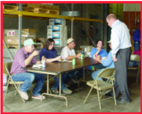
Des Moines Employees