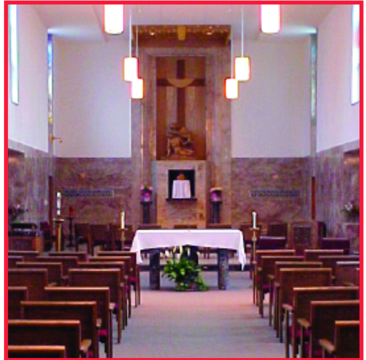
Servants of Mary Chapel - After

ing in the nave and narthex all connected to a new dimming panel. The difference in the chapel is spectacular. All trades worked very hard to have the chapel available to the sisters by Easter. The chapel was indeed available for Easter services and was formally re-dedicated by Archbishop Curtis on May 9, 2004.