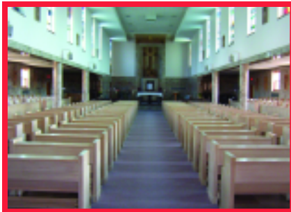
Servants of Mary Chapel - Before

The project posed multiple challenges for completion. First and foremost was the tracing of the existing electrical circuits so that a new electrical service to the chapel could be created. First and foremost was the tracing of the existing electrical circuits so that a new electrical service to the chapel could be created, and several electrical changes made through the years made tracing of circuits a challenge. In addition, the chapel is in the center of the 1950's building