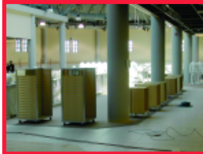
Saks Off 5th, Destin, FL

on 13 locations throughout Illinois, while Stacy handled locations to the west from Iowa to Montana. These installations take anywhere from 3 to 5 days to complete depending on the amount of entrances at a given location. Commonwealth provides 120V power and underfloor raceway installations at each store entrance to facilitate the equipment installation performed by Sensormatic. Doyle and Stacy have done a great job completing these projects within the given timeframe.