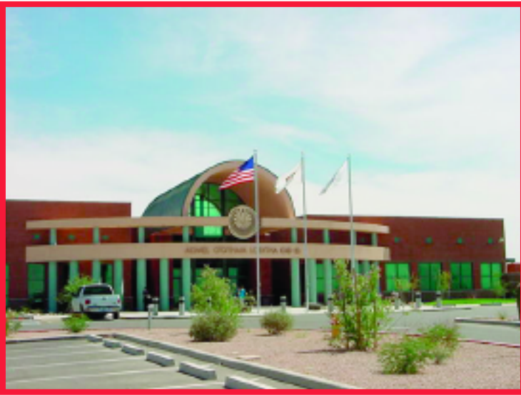
Tribal Courts Complex

All work on the reservation is performed subject to an “Indian Preference” employment policy that has been implemented by the tribal employment referral office. All other electricians have been referred from Local 640 out of the Phoenix area. We have received cooperation from both the tribal employment office and Local 640 that have allowed us to successfully man these projects.