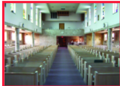
Servants of Mary Chapel - Before

and the balance of the building was to remain operational throughout the construction process. Any changes to the chapel electrical service had to maintain power to the rest of the building which houses offices and residence rooms.