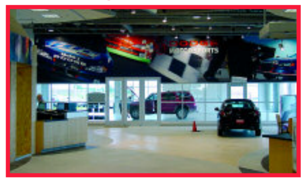
Service Desk Area