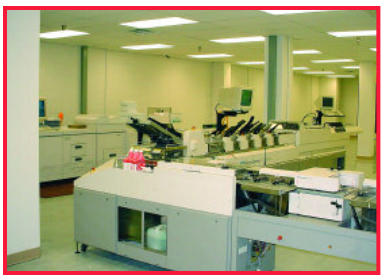
High Speed Printing

Some of the interesting and challenging work on this project included the addition of a 1200 amp switch (picked with a crane and rolled across the roof) in the north penthouse, installation of the 1200 amp feeder from the north penthouse to Panel MDP2 in the lower level electrical room 500 ft away, installation of the new generator distribution panel-board and its associated feeder from the existing outside generator. The tie-in required the generator to be shut down and a one-day rental of a portable 500 KW generator as back up in case of a power outage. Hot work included the disconnection of existing feeds from section 2 of MDB1 for the maintenance bypass panel-board and UPS1, and the hot tie-in of the new 800 amp third section added on to existing panel-board MDB1.