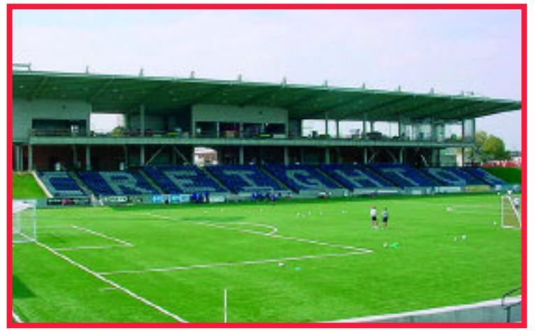
Creighton Soccer Stadium

Commonwealth has begun construction on the sound system for the newly constructed Creighton Soccer Stadium. This portion of the project began in August and will be completed during the middle of September. This project is a partner-ship between Electronic Contracting and Commonwealth. Both CECM electricians and low voltage technicians were required on this project, proving once again that working together to get a job, as well as get it done can be profitable for all sides.