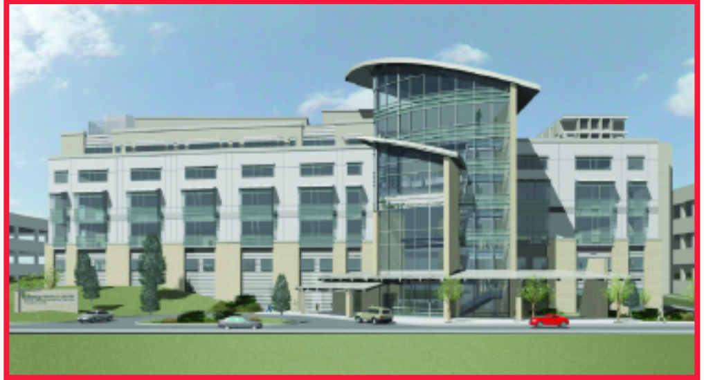
Overall View from East - Artist Rendering

New emergency power generation and distribution, energy plant upgrades, power distribution, lighting systems, critical power distribution, energy management systems, infant abduction system, fire alarm and nurse call systems, exten-