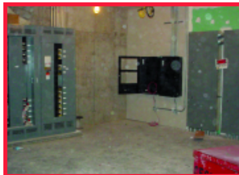
Partial of North Building Electrical Room in Basement