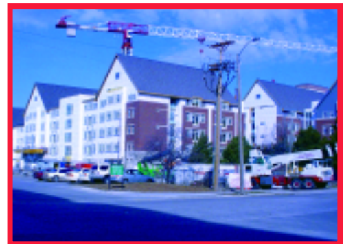
View of South Building