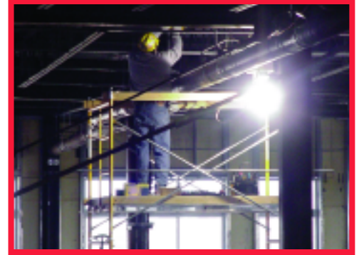
Rickie Scholl Installing Lighting Branch Conduit

Columbus Unit 1 is scheduled for start-up and checkout April 12-15.