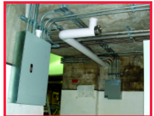
Conduit on Ceiling of Columbus Turbine Floor for Instrumentation, Oil Pumps & High Pressure Lift Skid