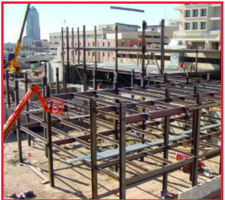
Mercy Medical Center East Addition