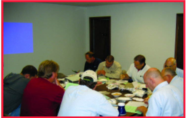
Des Moines Foreman Safety Training