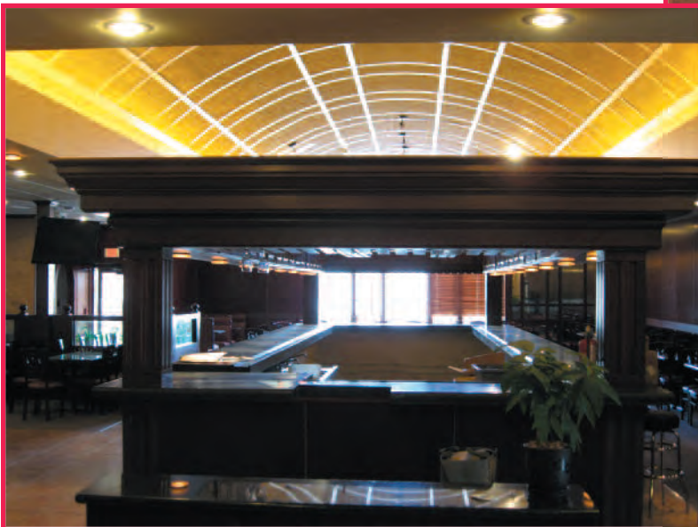
Eastern Buffet - West Des Moines