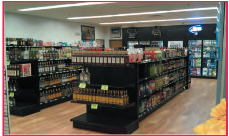
Interior of Store Addition

Many of the aspects of the Didier family business are similar to the tenants of the Commonwealth Electric team. Taking care of the gamut of electrical installations within our communities, providing high quality "done right, the first time" services, maintaining a team of long term and dedicated employees; and earning a solid reputation within the communities that we perform work!