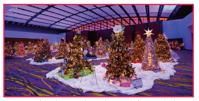
Some of the Christmas Décor at the Festival of Trees and Lights.