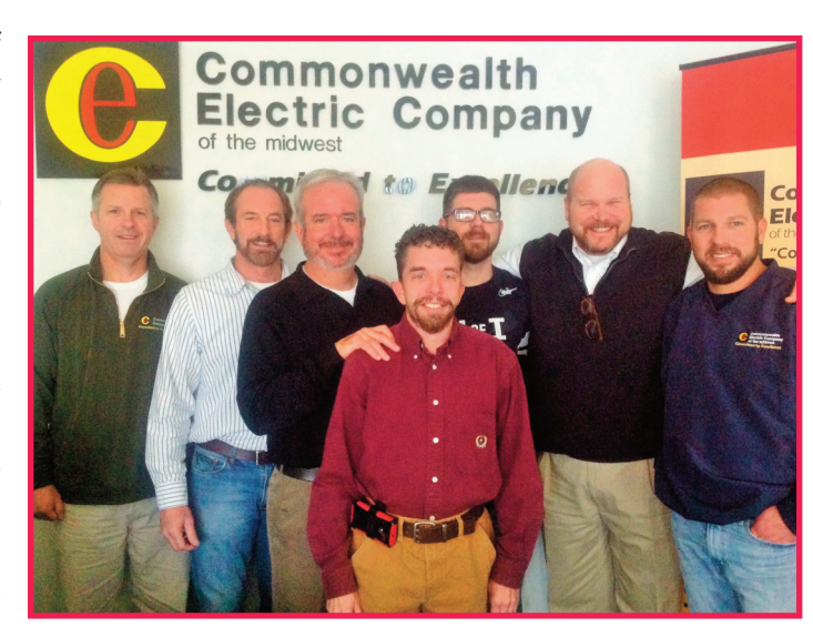
The men of the Des Moines office sporting their facial hair in support of "Moes for Joes"

Throughout the month of November while the men were growing their beards and mustaches, the ladies were also able to participate in the affair. Ladies were treated to mini-manicures featuring mini mustache decals courtesy of a local Des Moines salon. At the end of the month, "Moes for Joes" culminated in true fashion with a Shave-off Party at a local Des Moines business. The Des Moines office had great fun participating in this event and are proud to support the fight against blood cancers.