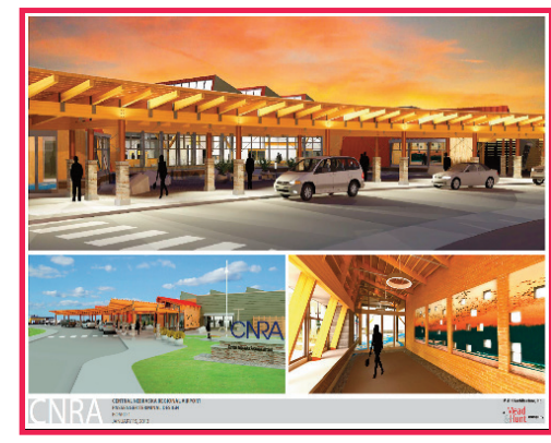
Central Nebraska Regional Airport

will be funded by the FAA, which is providing a grant of approximately $10.8 million. The new passenger terminal will offer passengers vast improvements over the current facilities. One of the major improvements will be the addition of two jet bridges as part of the new passenger terminal building. The current passenger terminal does not have jet bridges, therefore passengers must bare the elements when boarding and deboarding aircraft. The new terminal will also be utilizing geothermal technology for heating/cooling energy savings. On Oct. 29th, CNRA had its official ground breaking ceremony. All demolition of existing structures has been completed and footings are currently being poured. One of the largest challenges with this project is that it complies with the Buy American Act since it is federally funded. Therefore, all efforts must be taken to purchase American made materials only. The project also complies with the Davis-Bacon Wage provisions. The project is slotted to be complete in early 2016. This is the first time Commonwealth Columbus and Hausmann have teamed up together and there are high hopes to build a lasting relationship with the contractor.