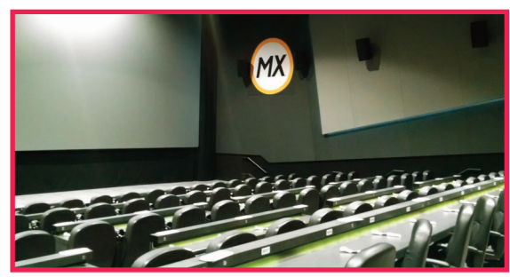
Dolby ATMOS Theatre