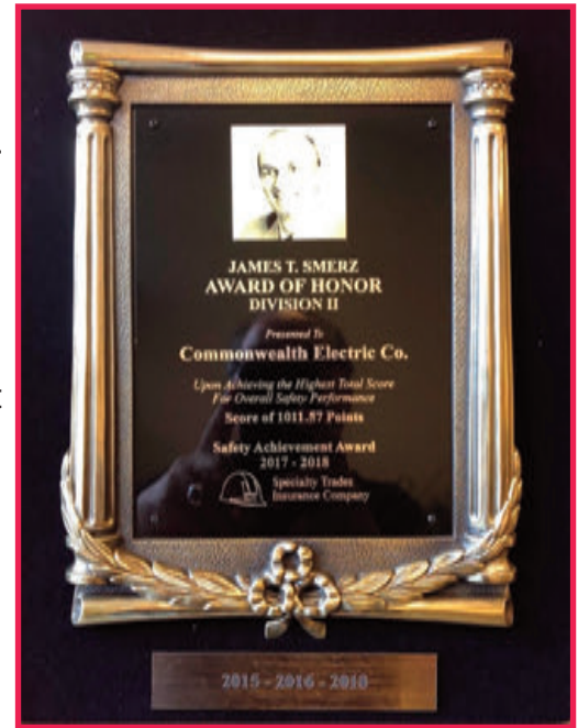
Commonwealth Electric Company Safety Program Promote it, Sell it, be Proud of it!

I've said many times, awards are nice to receive. It's nice to be recognized by our customers and peers. But the biggest award is everyone going home safe to families and friends and knowing the job got done with skilled and knowledgeable workers who truly believe in safety. Without you, our employees, believing in our safety mission these awards would not be possible. Everyone deserves a big pat on the back.