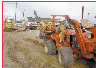
Juan Lopez backfills a trench.

With the amount of work being done, we will be adding a new trencher to our inventory of equipment in December. This will replace the old r-40 that we have worked to death. We're hopeful that we will be able to replace the small bucket truck next year so we can continue to provide good and adequate service to our customers.