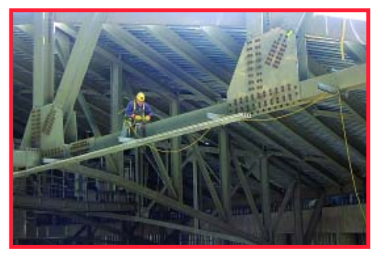
HIGH WIRING: Phil Bremkin connects an electrical conduit high atop the new Omaha Arena and Convention Center.

As a skilled work force, we have seen you in situations where someelse one mav decide not to do the work, but you have preformed these hazardous tasks and completed them safely. It is our job to ensure your safety and we do this in many ways. From the tool box talk you receive to the on-