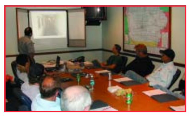
part of a new training program.

Additional training sessions are scheduled throughout the spring and summer months. Additional topics will be estimating, project