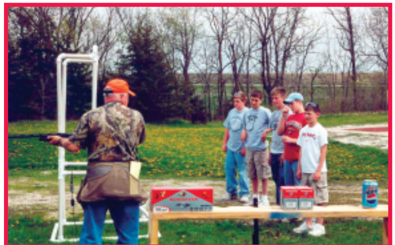
The team prepared for the YHEC competition through instruction in proper shotgun shooting and handling