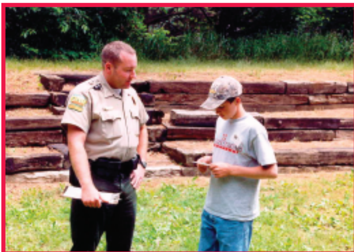
One of the team members gets ready to start the hunter safety trail with an Iowa DNR officer