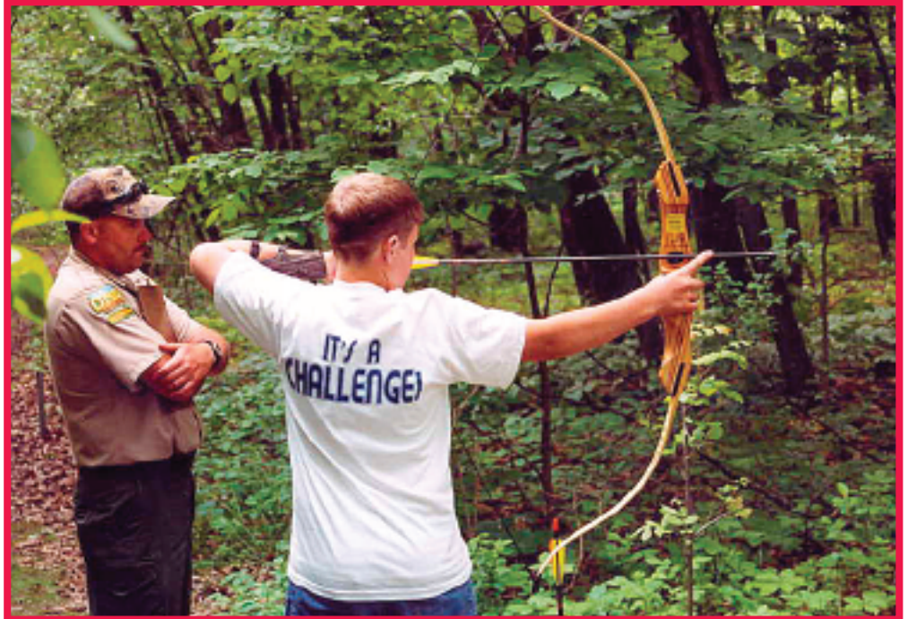
An Iowa DNR officer grades one of the boys during the archery event

Iowa YHEC (Youth Hunter Education Challenge) is a weekend-long event that takes place each June at the 4-H Education and Natural Resources Center in Madrid, Iowa. Youth from all over Iowa come to compete in eight events, learn about the outdoors, and have fun with other youth and adults that have similar interests. The events include four shooting events: archery, muzzle loading rifle, shotgun, and small-bore rifle. There are also four non-shooting events: wildlife identification, orienteering, hunter safety trail, and written exam. There are two age categories to compete in, Junior (ages 12-14) and Senior (15-19). Most youth compete as part of a team of five from their area, but youth can register as individuals as well. All participants must compete in all eight events.