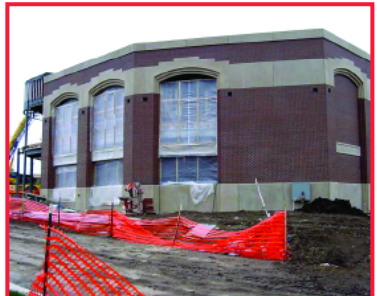
Peoples Bank Scheduled to Open in August