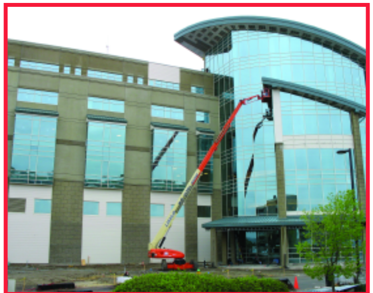
East Side Front Entrance of Mercy Tower Project

The tower portion of the work has included medium voltage switchgear feeding double ended 480 volt transformers for