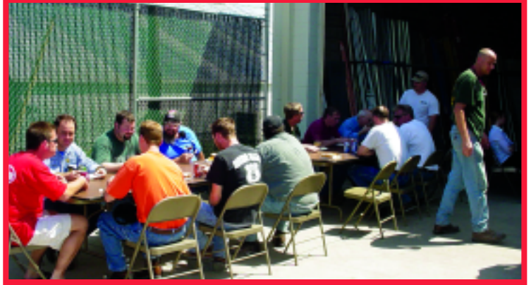
Des Moines Cookout

Many thanks to everyone who helped prepare the food and make all the cookouts a success. My personal thanks to each branch office staff that were instrumental in making these cookouts flow without any hitches. But, it is because of the work that all you, our electricians, do that allow us to be able to say we are a safe electrical contractor. Working safe has its rewards, not just a cookout, but a job well done and done safely. Thanks to all of you for working safe on the job and making Commonwealth Electric Company a leader in electrical safety.