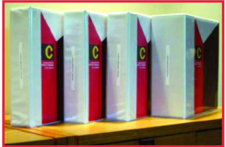
CECM Management 101

As of this date, four seminars have been taught with three of our six locations participating. It is the intent of Management to have these seminars given at least every six months at each location.