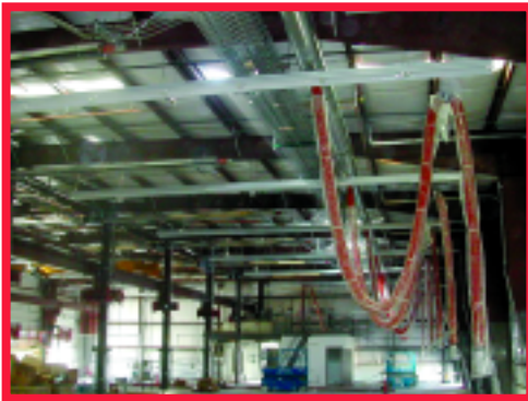
Tucson Fire Maintenance Facility