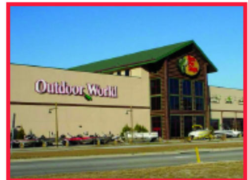
Bass Pro Shops

The store opened on time in November 2005 and has been very busy since. We are finishing the restaurant which is scheduled to open in early March 2006. Thanks to everyone involved in making this a successful project for Bass Pro Shop and Commonwealth Electric.