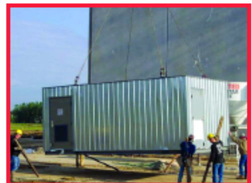
Premanufactured Electrical Room