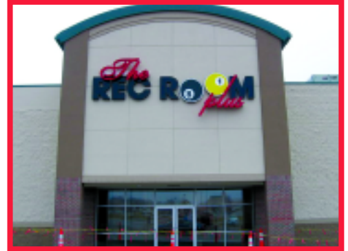
The Rec Room Plus – Omaha

If you are in Omaha and looking for new recreational supplies, stop by The Rec Room to check out the wares and Commonwealth’s design/build capabilities!