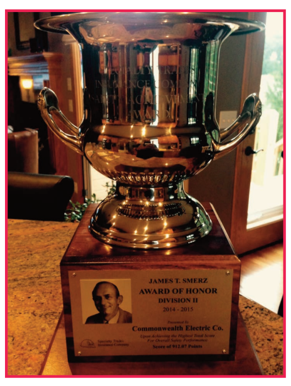
James T. Smerz Award of Honor presented to Commonwealth Electric Company of the Midwest

The award of honor for the past policy period was awarded to Commonwealth Electric Company. Basically putting it, we are the best of the best. This a huge accomplishment that everyone in our family should be proud of. It sends a message to the customers and potential customers that we sincerely care about the safety of all employees. Everyone's safety is our top priority and will always be the foundation of our business. To all the members of Commonwealth Electric, this is our award and very well earned. Good job everyone!