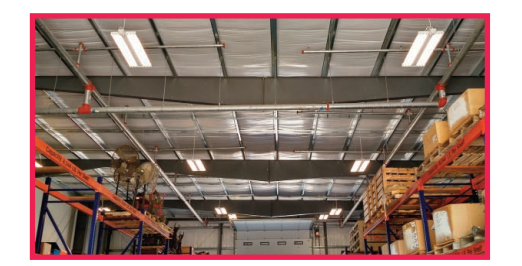
McAninch Cold Storage Addition with 6lamp T5HO fixtures

The Des Moines office has been diligently working with McAninch Corporation over the course of the past year. Everything from the office addition, accompanied by an office renovation, shop addition and the current replacement of all the shop lights has been set into motion. The McAninch Corporation, founded and located in Des Moines, Iowa, is one of the largest dirt work contractors in the state. Due to recent growth over the past few years, their 76,500-plus square foot maintenance/operations facility was in need of expansion and renovation. Commonwealth Electric furnished and installed fix-