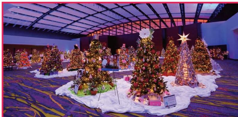
Some of the Christmas Décor at the Festival of Trees and Lights.