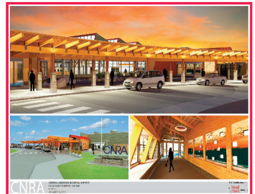
Central Nebraska Regional Airport

This project consists of the construction of a new 33,750 sq. ft. building which will replace the airport's existing 10,000 sq. ft. passenger terminal. The total investment made by the CNRA will be approximately $14.1 million. A large portion of the project will be funded by the FAA, which is providing a grant of approximately $10.8 million. The new passenger terminal will offer passengers vast improvements over the current facilities. One of the major improvements will be the addition of two jet bridges as part of the new passenger terminal building. The current passenger terminal does not have jet bridges, therefore passengers must bare the elements when boarding and de-boarding aircraft. The new terminal will also be utilizing geothermal technology for heating/cooling energy savings. On Oct. 29th, CNRA had its official ground breaking ceremony. All demolition of existing structures has been completed and footings are currently being poured. One of the largest challenges with this project is that it complies with the Buy American Act since it is federally funded. Therefore, all efforts must be taken to purchase American made materials only. The project also complies with the Davis-Bacon Wage provisions. The project is slotted to be complete in early 2016. This is the first time Commonwealth Columbus and Hausmann have teamed up together and there are high hopes to build a lasting relationship with the contractor.