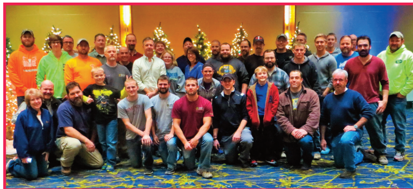
Commonwealth employees during the Festival of Trees.