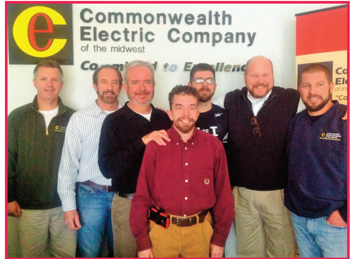
The men of the Des Moines office sporting their facial hair in support of “Moes for Joes”

Throughout the month of November while the men were growing their beards and mustaches, the ladies were also able to participate in the affair. Ladies were treated to mini-manicures featuring mini mustache decals courtesy of a local Des Moines salon. At the end of the month, “Moes for Joes” culminated in true fashion with a Shave-off Party at a local Des Moines business. The Des Moines office had great fun participating in this event and are proud to support the fight against blood cancers.