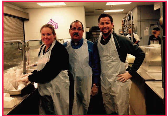
Commonwealth Electric Safety Department "Giving Back"

We started volunteering at the Open Door Mission. Every year during the holidays we serve lunch to those who don't have the opportunities we have here at Commonwealth Electric. I'm humbled at the faces of those we help, especially the children. Part of safety is caring. When we are out on jobs and notice a behavior that might cause an injury, our reaction is not what I am going to do with this person, rather express our concern that we care about their safety and don't want them injured. The Open Door Mission is thankful for the commitment Commonwealth Electric has made that has helped them during a busy time of the year.