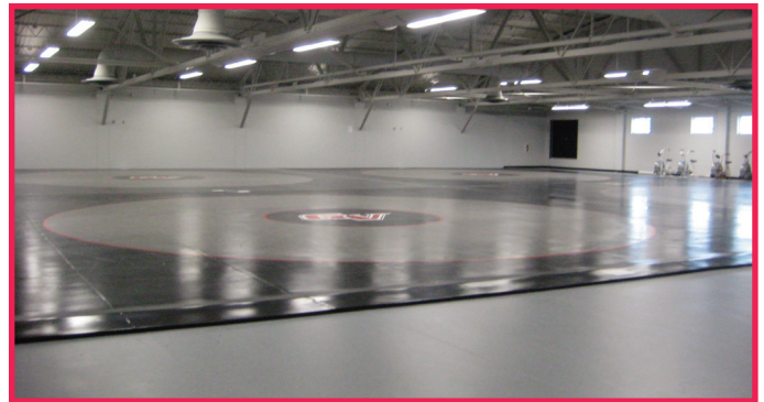
Newly renovated Grand View University wrestling facility

Commonwealth Electric recently completed the construction of the newly improved Grand View University wrestling practice facility in Des Moines. The space was part of an extensive remodel of an old bowling alley that Grand View University acquired and converted to a multi-sport athletic facility. The project consisted of the removal of approximately 20 bowling lanes which transformed the space into four wrestling mats, an office, lounge, conference room, and men’s and women’s locker rooms.