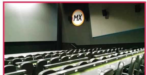
Dolby ATMOS Theatre