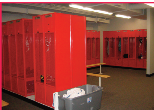
Locker room in Grand View University wrestling facility