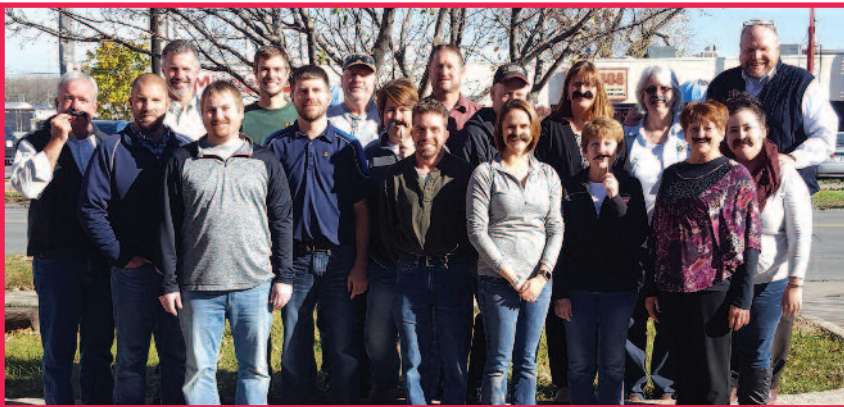
The Des Moines office sporting their facial hair in support of “Moes for Joes”

“Moes for Joe” began back in 2011 in honor of a young Des Moines’ boy battling leukemia. Since then, the “Moes for Joes” fundraiser has raised thousands and thousands of dollars, with the incredible support of local Des Moines businesses, to benefit the children and their families fighting these cancers.