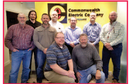
Lincoln corporate office

challenges men to grow out their facial hair in sporting fashion for one whole month to show their support in the fight against blood cancers. Commonwealth’s Corporate office in Lincoln decided to join in the fun as well this year. Like “Moes for Joes”, their “No Shave November” challenge committed to raise funds for a local cause in Lincoln, Nebraska. The Des Moines office continues to look forward to this entertaining challenge every year and to show their support in the form of donations to benefit the Leukemia & Lymphoma Society.