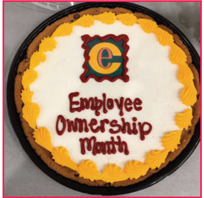
Des Moines Employee Ownership Month Cookie

Throughout the month we also had a few contests that employees could participate in, and at the same time, they learned more about the nuts and bolts of our ESOP plan. We know with being new to an ESOP there are always lots of questions and concerns, and this was a great opportunity for employees to ask questions, and, be rewarded with gift cards for submitting questions!