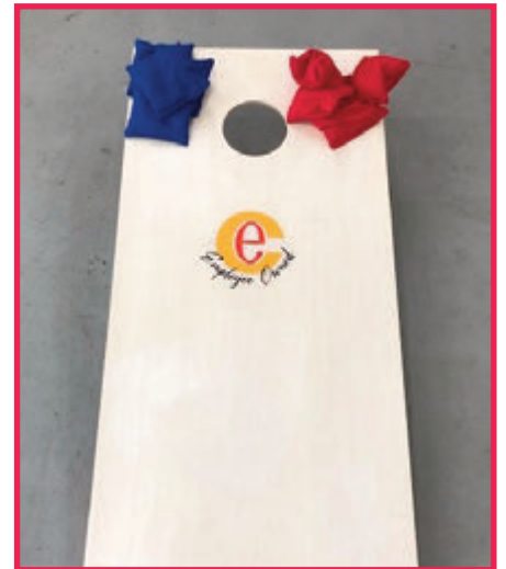
Omaha Cornhole Tournament