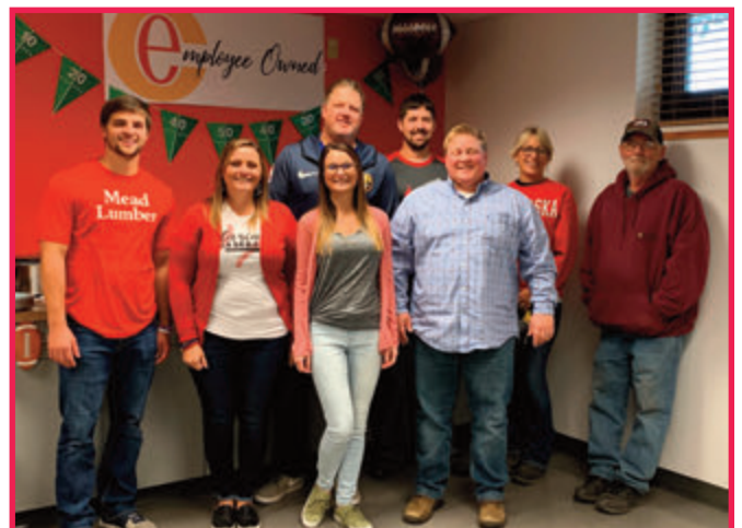
Columbus Branch Employee Ownership Month Tailgate