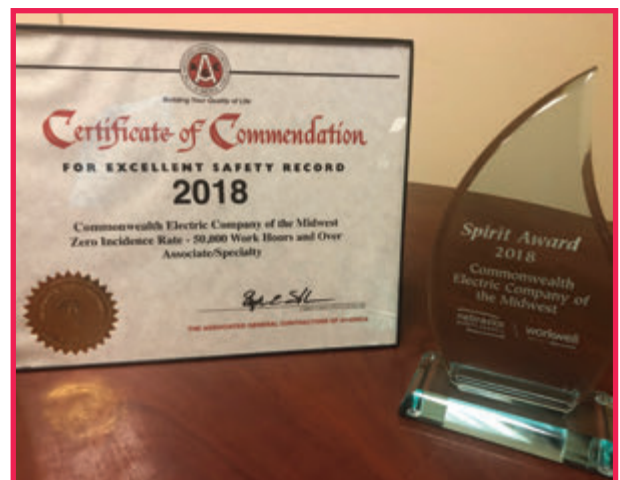
Safety Awards and Recognition