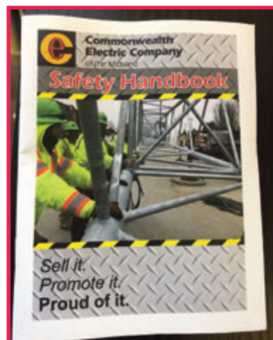
New Employee Safety Handbook

Commonwealth Electric Safety, we Sell it, Promote it, Proud of it