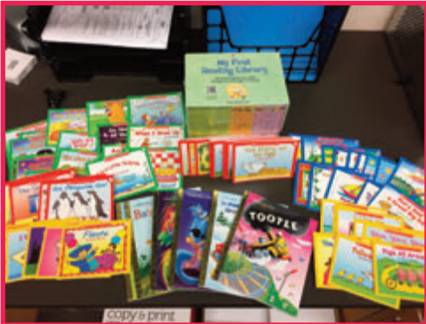
Phoenix Expo Donations