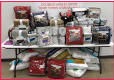
Des Moines Donations to Youth Homes of Mid-America