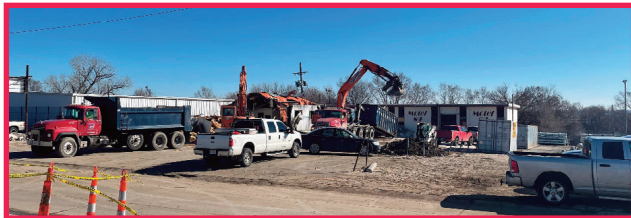
Pic. 2: Docs Bar (Demo Complete) & Motel 89 (Back)

Omaha, NE: Commonwealth Electric – Omaha has procured the land, just south of our current branch office. We purchased the land, parking lot, and two buildings located here: Motel 89 and Doc's Bar. (Shown in Pic. 1)