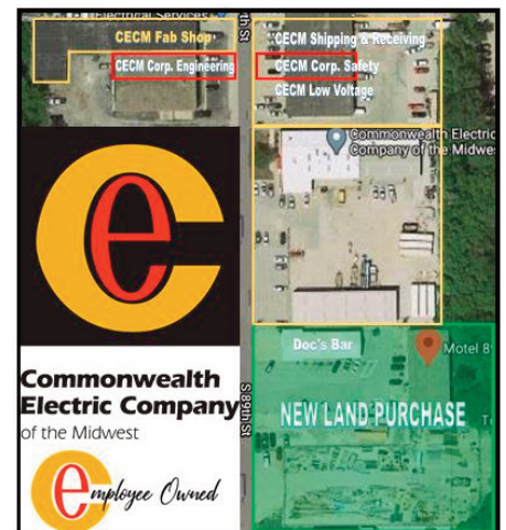
Pic. 3: Yellow Box = Current Omaha Offices Red Box = Corp. Offices & Green Box = New Land Purchase

So, it is with great anticipation, as we look toward the future and the expansion of our Omaha, NE operations.