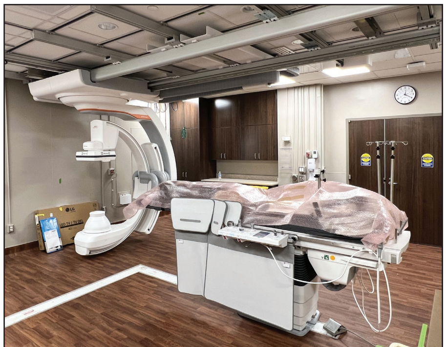
A new piece of imaging equipment within the newly remodeled IR Room 9.