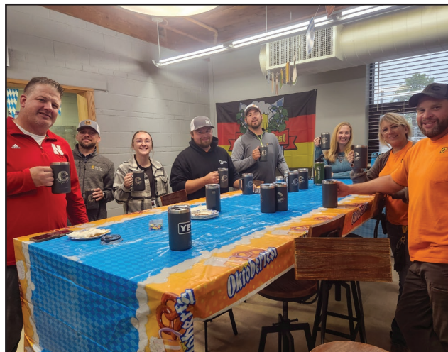
The Greater Nebraska team compete in a stein holding contest.