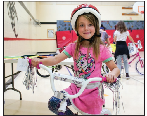
A student at Pershing Elementary School in Lincoln, NE, receives her brand-new bicycle.

For Commonwealth's 2023 Progress Meeting, a conscious decision was made to include a team-building activity that could benefit others in some way. To do so, Commonwealth teamed up with VentureUp, a company that specializes in corporate team-building activities. For the team building, VentureUp provided 36 unassembled bicycles in all sizes and colors for employee teams to assemble. Prior to the bike assembly, attendees were challenged with numerous team-building exercises, one of which involved a mouse trap! Please rest assured that no individuals or animals were injured during this particular exercise.