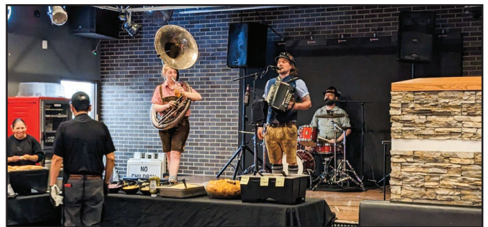
The Corporate and Lincoln offices enjoyed listening to a live Polka band.

Of course, any celebration has to include some fun! In 2023, this included a company-wide pumpkin decorating contest, root beer floats, pretzel and chocolate treats, and many other fun activities. Commonwealth's Employee Ownership Committee members begin working months ahead of October to outline a fun theme and decide on the education and activities that took place for the month. Thank you, committee members, for all your hard work making this a great month!