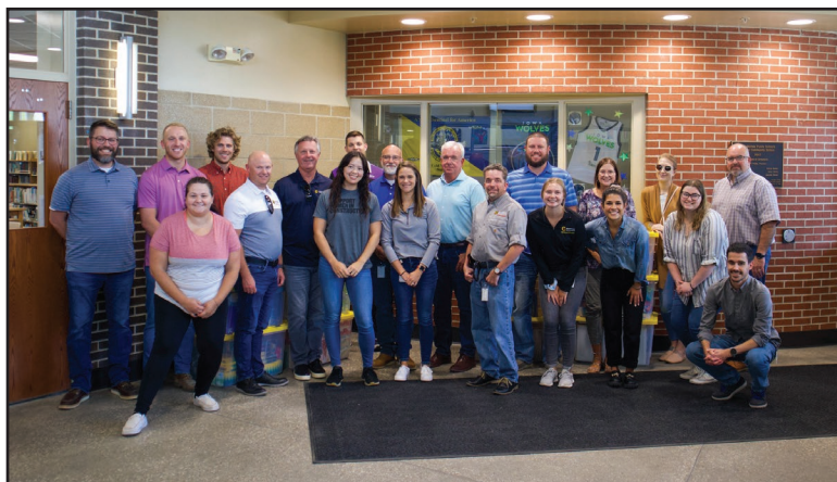
The Des Moines team deliver their donations to George Washington Carver Community School.

Our Phoenix location did an outstanding job of not only collecting items but also involving our field personnel and suppliers we work with. Graybar and Wesco, both companies Commonwealth does business with, were very generous with donations of backpacks and other supplies and were very excited to be able to participate in the drive.