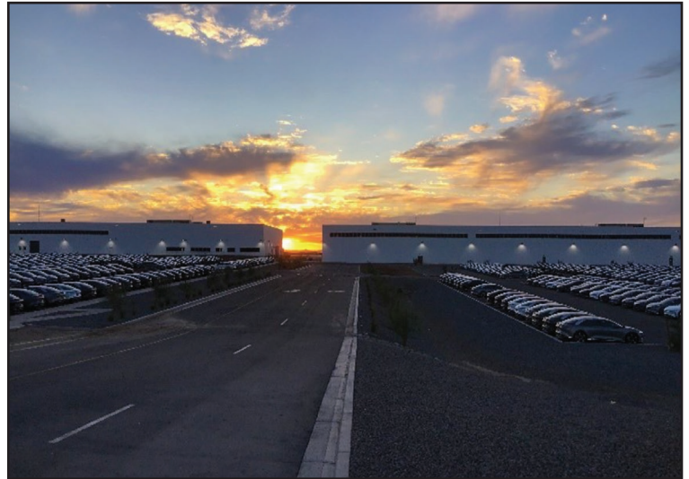
The sun rises over the Lucid AMP-1 site in Casa Grande, AZ.