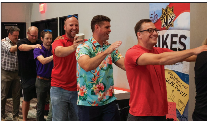
Employees participate in a team-building activity before assembling bikes.