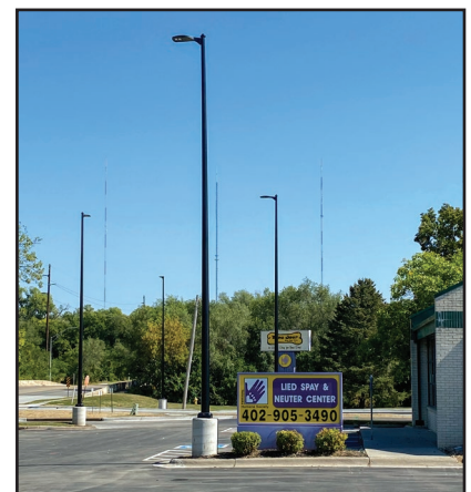
The upgraded light poles in the parking lot.