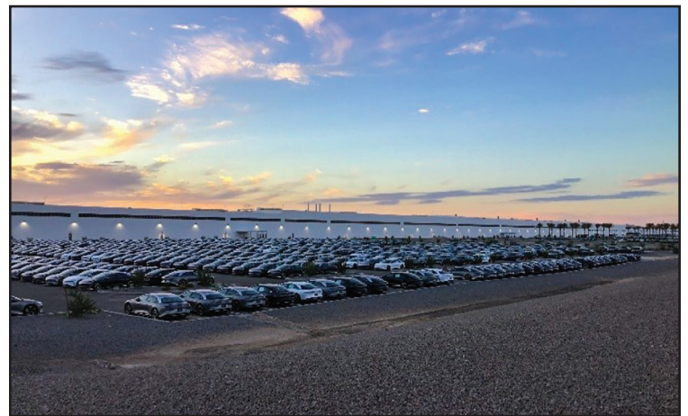
The new facility houses the finishing assemblies for Lucid Motors' high-end vehicles.