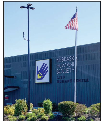
The Nebraska Humane Society building.

The collaboration efforts of all team members of Commonwealth Electric Company of the Midwest (electrical and line crew teams), Kiewit Client Services Group, NE Humane Society, OPPD, City of Omaha, and Echo Systems made this project a success and one that we are proud of.