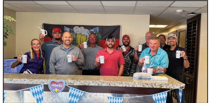
The Rydalch Electric team celebrates with root beer floats.

In 1982, the National Center for Employee Ownership decided it would be a fun idea to celebrate Employee Ownership Week. A couple of years later, a poster contest for Ownership Week was introduced. Upon seeing this, The Employee Stock Ownership Plan (ESOP) Association embraced the idea, and the week officially became Employee Ownership Month. Today, employee-owned companies around the country celebrate by holding special communication events, playing games, holding picnics, and having fun celebrating being company owners.