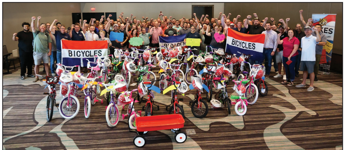
Employees at Commonwealth's 2023 Progress Meeting celebrate after assembling the 36 bicycles.