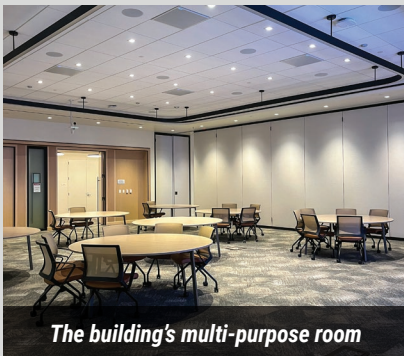
The building's multi-purpose room

Our team in Phoenix greatly values its relationship with Kitchell Contractors and CommonSpirit Health and looks forward to future collaboration.