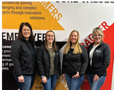
Our Greater Nebraska team

This year's Women in Construction Week, championed by the National Association of Women in Construction (NAWIC), was a significant occasion for Commonwealth. Throughout the week of March 2-8, our teams organized events to acknowledge and celebrate the contributions of women to the construction industry.