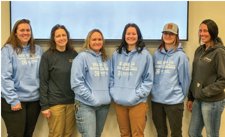
Our Des Moines, IA, field team