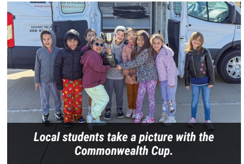
Local students take a picture with the Commonwealth Cup.

The cup and this opportunity underscore the importance of workplace safety, the tools we use every day, and the dedication of our Commonwealth employees to ensure everyone returns home safely each night.