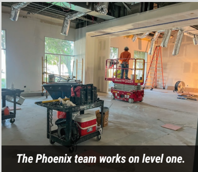
The Phoenix team works on level one.