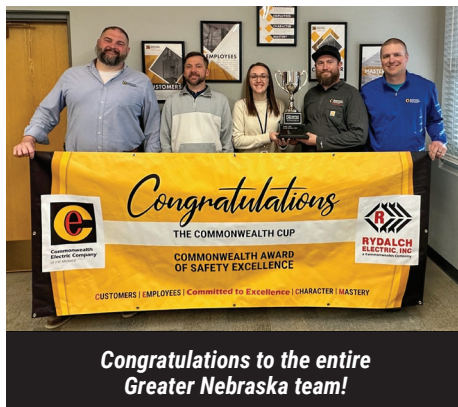
Congratulations to the entire Greater Nebraska team!

On behalf of the Safety Department and the Executive Leadership Team, thank you, everyone, for working safely each and every day.