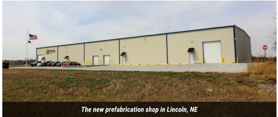
The new prefabrication shop in Lincoln, NE

The shop has been strategically laid out with a bending station—including four different types of benders—and a complete threading station, able to handle pipe up to six inches in diameter. There is a metal fabrication area which includes a strut shear, oxy/acetylene torch set up, and a welding