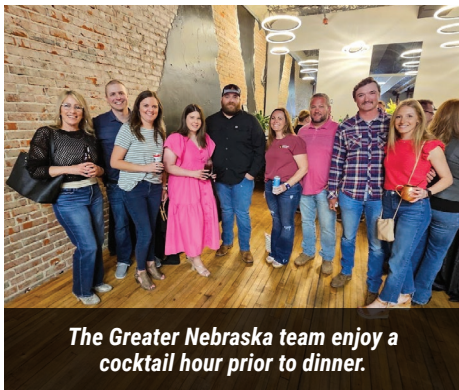
The Greater Nebraska team enjoy a cocktail hour prior to dinner.

We're excited to announce the winners of our second annual Commonwealth Cup: our team in Greater Nebraska! Congratulations to the entire Greater Nebraska for their outstanding efforts this past year; their win is very much deserved!