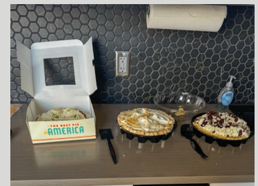
Omaha employees had many tasty options to choose from.

To commemorate Pi Day, the Omaha, NE, office celebrated with a get-together of eating—you guessed it—pie! Our team enjoyed great conversation while enjoying a special treat from Village Inn. Their pies never disappoint, especially with flavors such as lemon meringue, key lime and French silk.