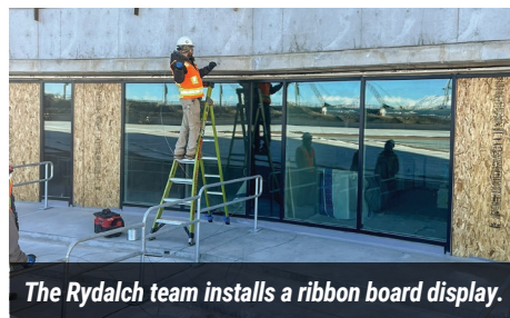
The Rydalch team installs a ribbon board display.

The project was completed under a tight timeline, with a majority of the