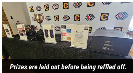
Prizes are laid out before being raffled off.