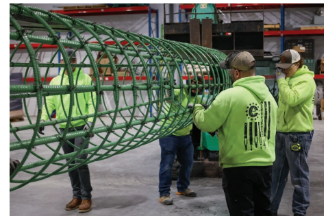
The Lincoln team assembles base cages for traffic poles.

This new prefab shop is more than just a building; it represents our commitment to growth, innovation, and the continuous development of our team and our overall prefab efforts. Our dedicated team has been instrumental in bringing this project to fruition. The future is bright, and we look forward to the many opportunities our world-class facility will provide.