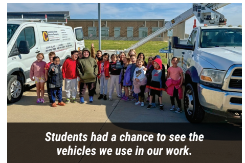
Students had a chance to see the vehicles we use in our work.