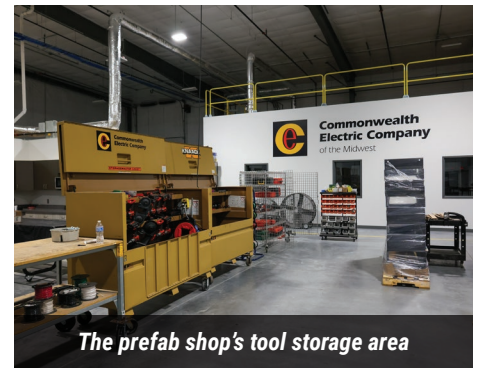
The prefab shop's tool storage area