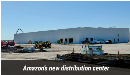
Amazon's new distribution center

U.S. GDP and created numerous jobs in small towns. Additionally, independent sellers in the U.S. sold more than 4.5 billion items, averaging over $250,000 in annual sales. Amazon’s investments continue to bring jobs and opportunities to communities across America.