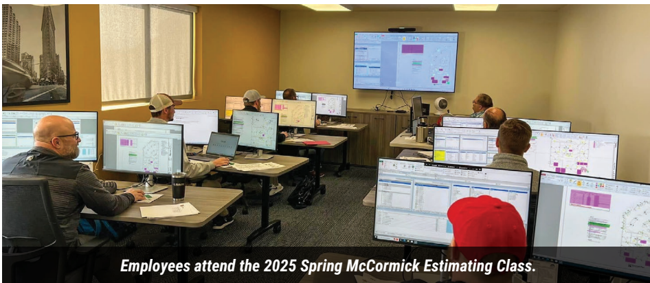
Employees attend the 2025 Spring McCormick Estimating Class.

As snow blanketed numerous branch locations and service areas late this winter, Employee Owners from across the country converged in Lincoln, NE, to light the fire and begin 2025 in full gear.