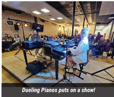
Dueling Pianos puts on a show!

While the Greater Nebraska location reached the pinnacle of safety within our company, we had two other locations that were right on their heels and also deserve some recognition. In second place was last year's winners: our team in Tucson, AZ. In third place was our team in Phoenix, AZ. Fantastic work to both our desert-dwelling locations!