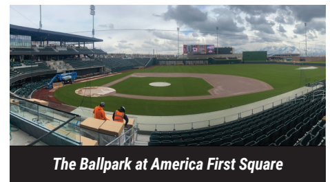
The Ballpark at America First Square