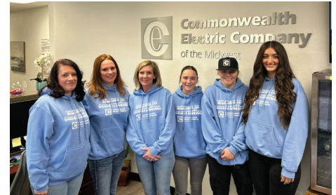
Our Phoenix, AZ, team