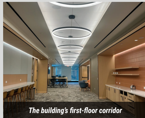
The building's first-floor corridor