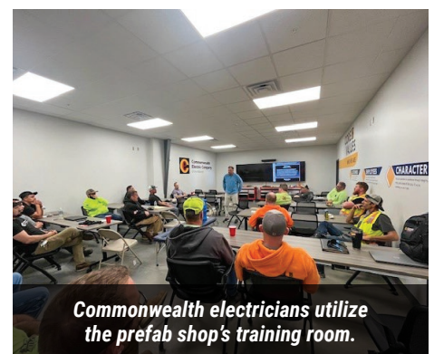
Commonwealth electricians utilize the prefab shop's training room.