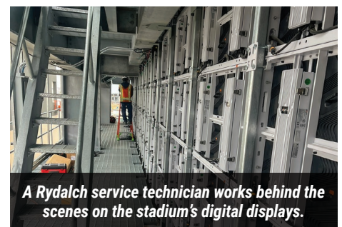
A Rydalch service technician works behind the scenes on the stadium's digital displays.