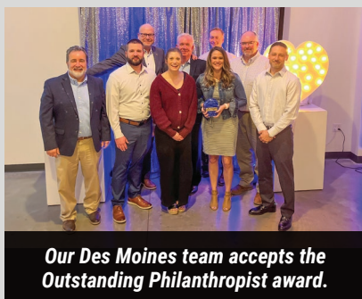
Our Des Moines team accepts the Outstanding Philanthropist award.

As well as financial support, our team is involved in volunteering. Each year, we participate in the Festival of Trees and Lights, contributing countless hours to this beloved event.