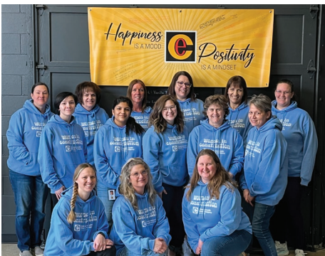
Our Omaha, NE, team