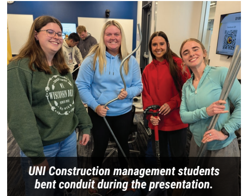
UNI Construction management students bent conduit during the presentation.