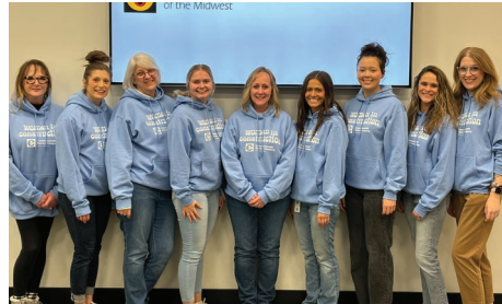
Our Des Moines, IA, overhead team