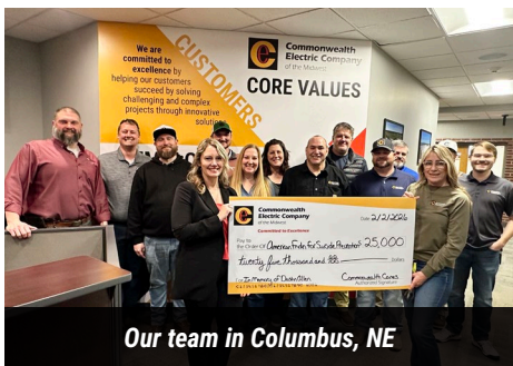
Our team in Columbus, NE

Commonwealth Cares empowers employees to nominate organizations and causes that matter most to them, ensuring our giving reflects the many diverse experiences, passions, and needs of our people and the communities we serve. Representatives across our locations once again played an essential role in selecting this year’s recipients, fostering a sense of ownership and connection that is deeply embedded in our culture.