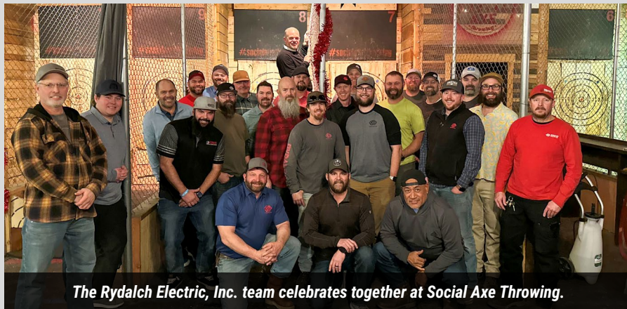
The Rydalch Electric, Inc. team celebrates together at Social Axe Throwing.

a break from the stresses of the job site. It fostered lighthearted competition and team interaction, highlighting the value of connection and morale.