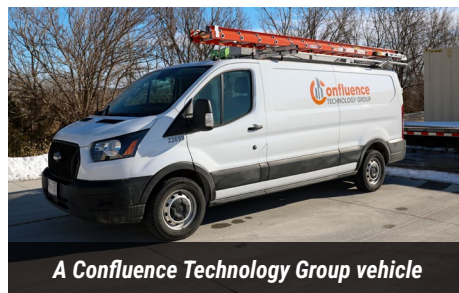
A Confluence Technology Group vehicle