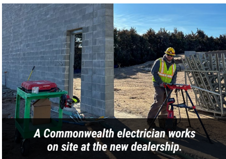
A Commonwealth electrician works on site at the new dealership.

As the dealership takes shape, this project stands as an exciting example of CECM's ability to deliver high-quality work on large, multifaceted builds. The Grand Island Woodhouse Toyota/Honda dealership will soon become a standout facility for the community, and our team is proud to help bring this modern, expanded vision to life.