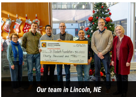
Our team in Lincoln, NE