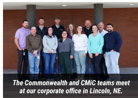
The Commonwealth and CMiC teams meet at our corporate office in Lincoln, NE.