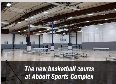
The new basketball courts at Abbott Sports Complex

The Lincoln Sports Foundation serves youth and families