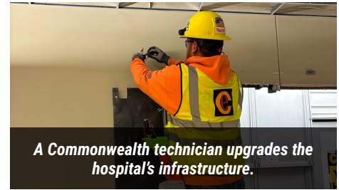
A Commonwealth technician upgrades the hospital's infrastructure.