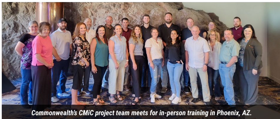
Commonwealth’s CMiC project team meets for in-person training in Phoenix, AZ.

Additionally, the platform standardizes processes across departments, resulting in a more consistent customer experience, from project initiation through completion, ensuring that every customer receives the same high level of service and