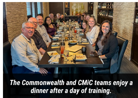
The Commonwealth and CMiC teams enjoy a dinner after a day of training.

communication at every stage. Bringing CMiC to life has been a true team effort, with collaboration happening across all our locations. Employees from different departments and offices came together, sharing expertise and insights to tackle challenges and ensure a smooth implementation. This collective commitment not only accelerated the rollout but also helped build best practices that will benefit us company-wide.