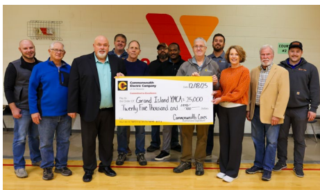
Our team in Grand Island, NE