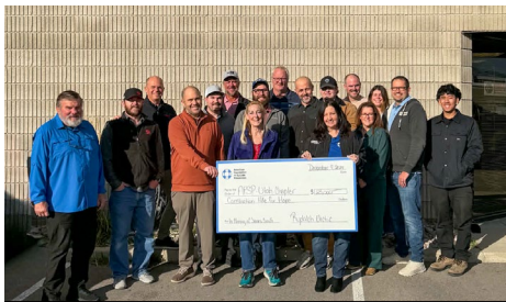
Our team in Salt Lake City, UT

This year, Commonwealth continued to strengthen its commitment to corporate giving through our Commonwealth Cares initiative, a program that unifies all philanthropic efforts under our guiding purpose: Energizing Communities for a Brighter Tomorrow.