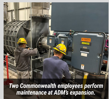
Two Commonwealth employees perform maintenance at ADM's expansion.

Safety was a daily commitment. Working inside an active facility, we paired pre-task planning and rigorous procedures around live-plant interfaces with consistent housekeeping and coordinated scheduling to minimize downtime and disruption. This discipline kept the project moving smoothly and set the stage for reliable performance from day one.